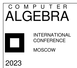
Figure 1: A figure caption example

Tables and figures should contain the \caption command. Please put \label command after it.